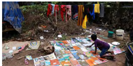
a student drying out rescued school books