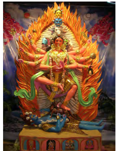
Replica of a Gujhyakali idol worshipped in a Nepalese Temple, Kolkata.

A long a walk within, on a way to be, we ride white horses to clearly see.