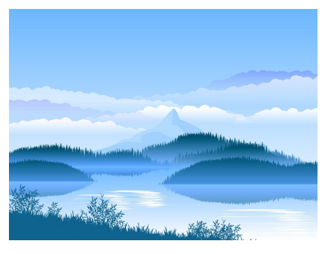
Lake, Mountain, Forest 2021

From the Advaita-Vedanta tradition: Clouds come and go in the sky, but the appearance and disappearance of the clouds doesn't affect the sky. Your real nature is like the sky, like space. Just remain like the sky and let thought clouds come and go.