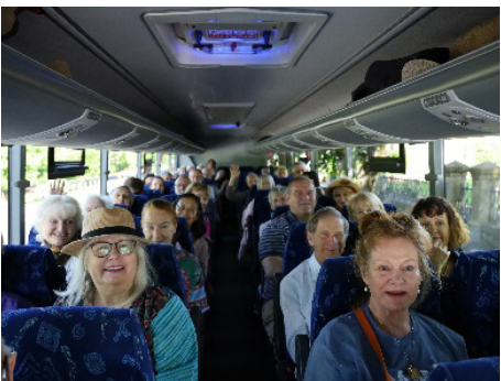
Outing to Hallett Cove