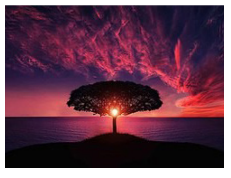
Sunset and Tree, 2012, Bessi (Pixabay). Wikimedia Commons (Creative Commons CC0 1.0 Universal Public Domain Dedication)

reach, TKs apply similar principles at a microcosmic level: each culture is steeped in its own rendering of Ageless Wisdom. Like leaves on a giant tree, myriads of TKs contribute to the pulse of the tree of which they are an integral part. It is high time for western and other modern dominant cultures to adopt a different paradigm of what it means to be human.