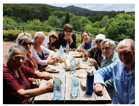
Picnic lunch at Mount Lofty Botanic Garden