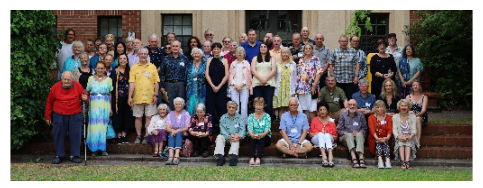
Delegates at 2023 National Convention, Adelaide